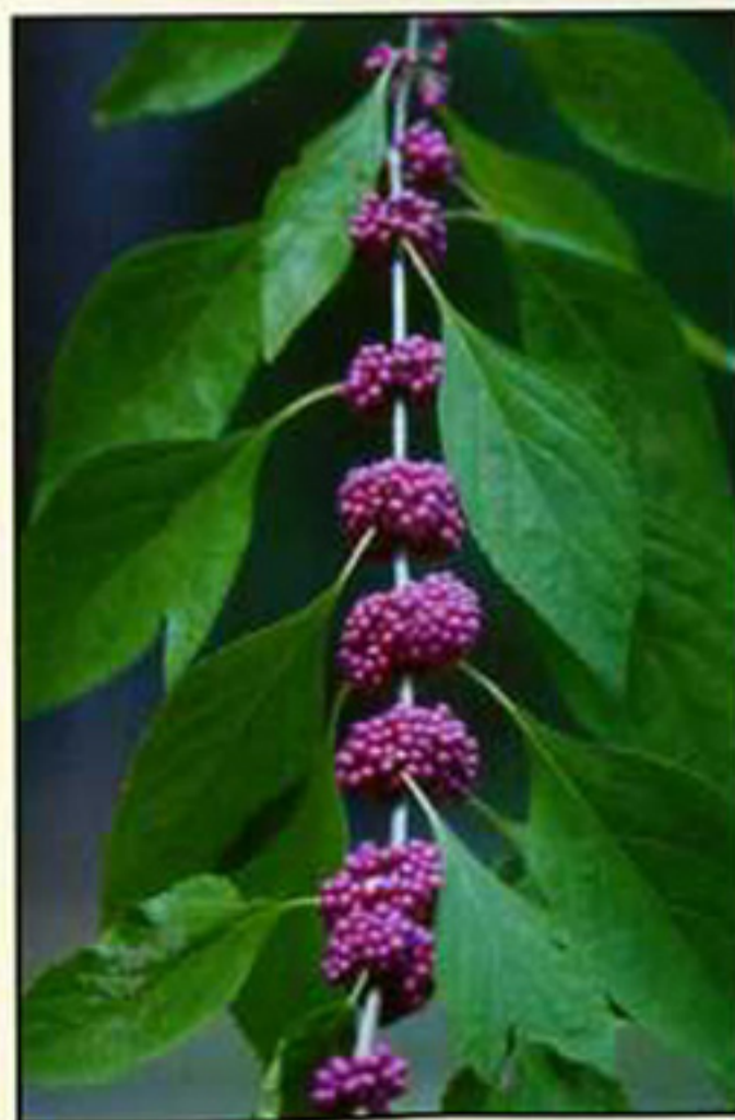
French Mulberry ( Callicarpa Americana )