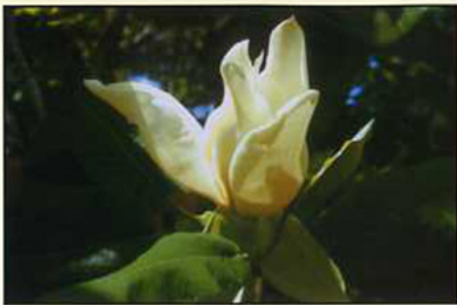
Bigleaf Magnolia ( Magnolia Macrophylla )